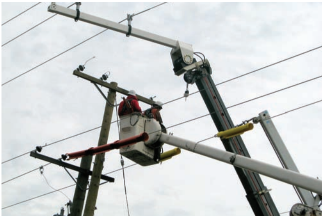
Live Line Solution's Insulated Conductor Support Jibs (ICSJ) and LinePro HA keep linemen safe and increase productivity by incorporating radio-controlled, hydraulic-actuated articulation.